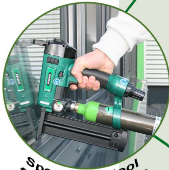
Specialized tool for glazing beads

Optional using with standard compressor or compressed air cylinder