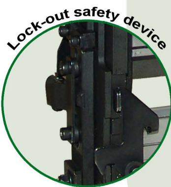
Lock-out safety device