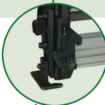
No mar tip